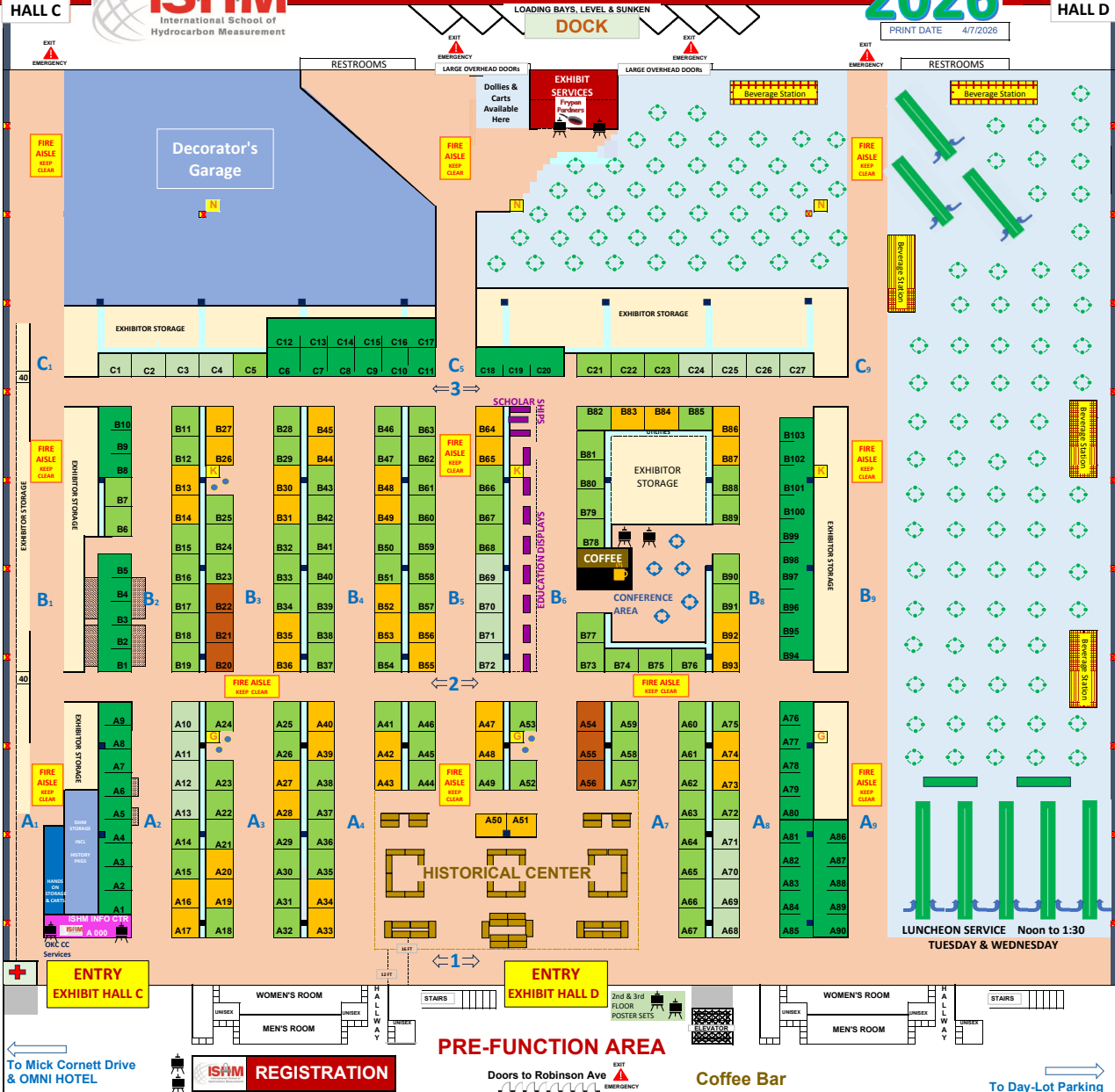
ISHM LAYOUT 2026 - OKLAHOMA CITY CONVENTION CENTER HALLS C & D plus 1st Floor Pre-Function Area

2026 Schedule Mobile Displays move in Monday 11-May by Appt Exhibitor Move-in Monday 11-May 5:00 pm Set up continues until 10:00 pm Tear down Thursday 14-May 10:50 am Hall to be clear by 4:00 pm Standard ISHM Booth 10 ft wide x 8 ft deep Mobile displays are 8 ft wide x 10 ft deep Each booth includes: Furniture carpet 6 ft table, skirted black & 2 chairs Wastebasket Standardized booth sign 1 electrical plug-in to 10 amp circuit